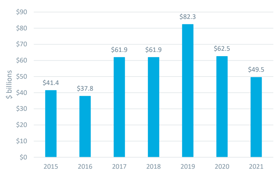
Chart 2: Global direct lending fundraising (shown as of June 2021)

Source: Preqin, Deloitte Alternative Lender Deal Tracker