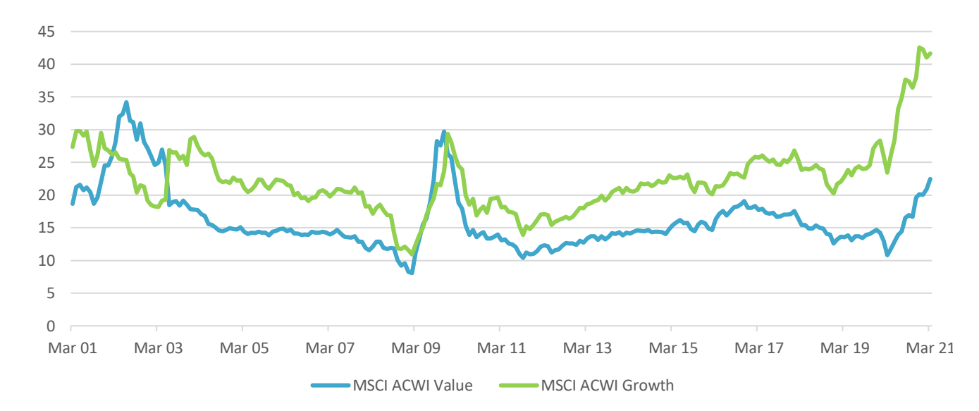
Chart 1: Valuation spread between value and growth (based on P/E ratios)

P/E represents index price / earnings-weighted average of index constituents